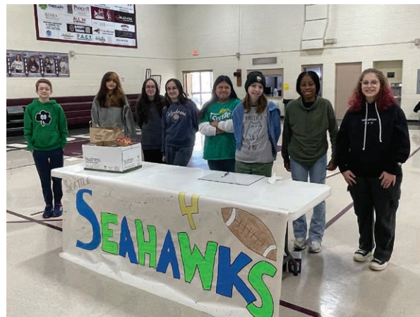
Pep rally during the week of the Super Bowl