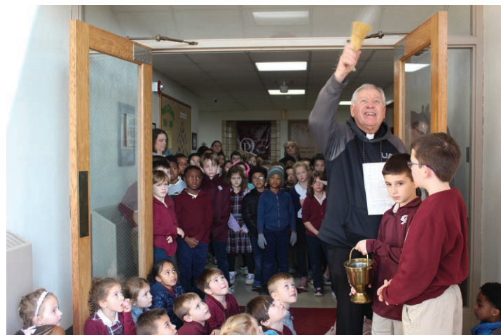
The Epiphany door blessing