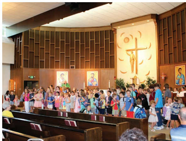
The Backpack Blessing in August, kicking off the school year

Parishioners are invited to get involved at the school — volunteers are needed in many capacities. To learn more, call the school at 618-234-1206.