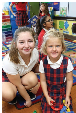
The Blessed Sacrament Big/Little Buddy program is a favorite tradition.