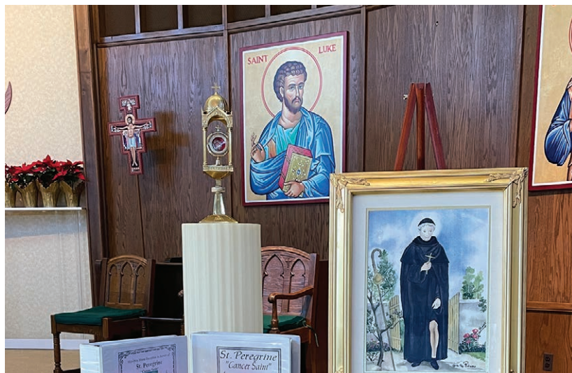
Special liturgies given by each class are a cornerstone of faith formation at Blessed Sacrament.