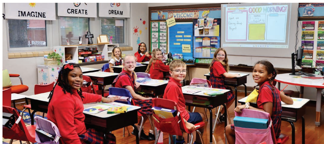
The fifth-grade class is ready for a great day of learning!

The school raises young people with Catholic values and a solid education from pre-K through eighth grade, preparing them for high school and beyond.